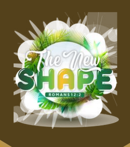
Genesis 1:1-5 1 Thessalonians 5:4-5 Psalms 104:24-25 Psalms 19:1 Psalms 139:13-16 1 Corinthians 6:19 1 Corinthians 1:27-29 Genesis 2:7 John 11:40 Hebrews 11:1 Romans 5:12 Romans 3:23 Hebrews 4:15 John 5:16-17